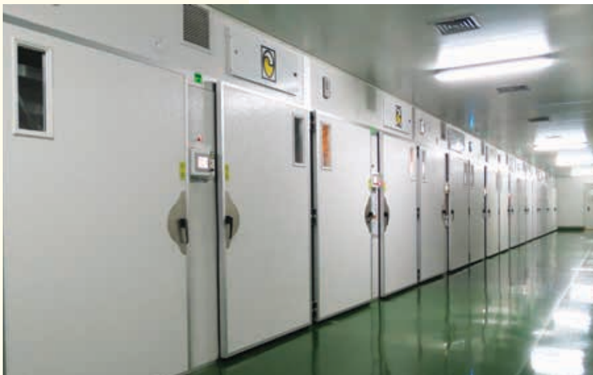
One of PT Sierad's setter corridors with 9 Avida A24-165 setters