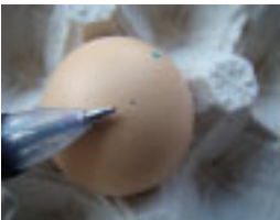
Very small punch hole