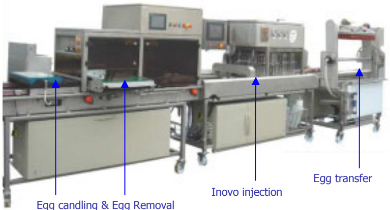
Egg candling & Egg Removal