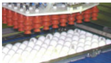
Fast operating unit Egg Removal in one shot