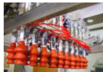
or Removal egg by egg